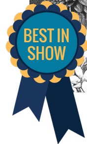
Cassidy Skinner South Whitley