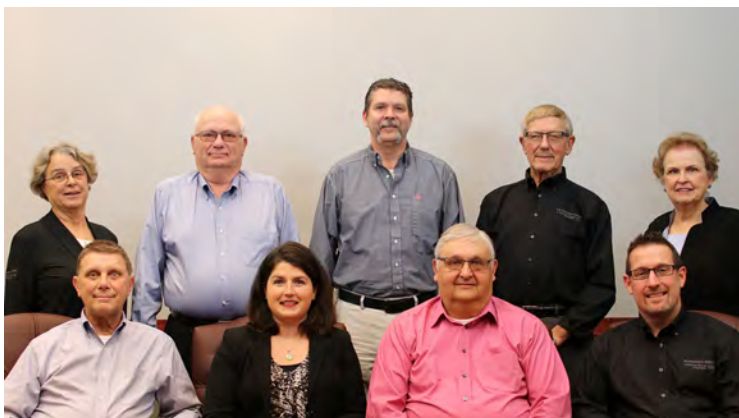
The current Northeastern REMC board of directors

For a full list of requirements, potential duties and explanation of the election process, please visit nremc.com .