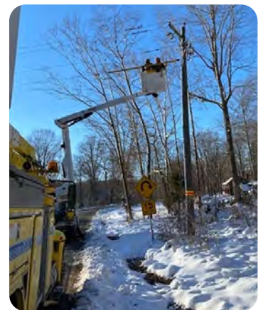
Above: A NREMC crew helps bring back the power in Virginia

95,000 people to lose power. Assisting other co-ops is one of our founding principles. If a storm caused severe damage to our area, we know we'd have hundreds of lineworkers headed our way too.